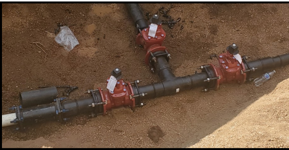
Example of a 3-way Intersection